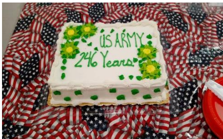
Cake & Ice Cream Served