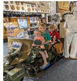
Visitors astride an army scout motorcycle.

The pictured Harley Davidson motorcycle, built in the United States, was driven around the world. Impossible says they. Au contraire says I. Stop in and have one of our expert Docent's explain how it was accomplished. An interesting saga.